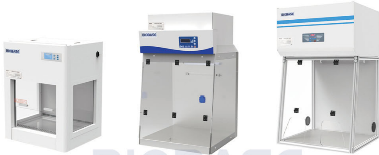
BBS-V500 & BYKG-VII